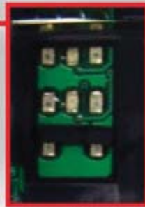
500dpi Optical Scanner Detail